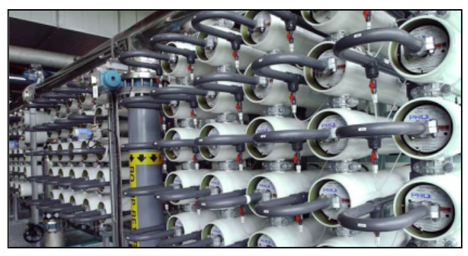
Reverse Osmosis (RO) Desalination

anthracite media, followed by cartridge filtration. The filtered water passes to the reverse osmosis membrane modules, equipped with state-of-the-art energy recovery devices. In keeping with the project's general goal to ensure reliability and continuous operation while also providing low cost water, electricity will be provided from two separate sources. A dedicated gas turbine power station, fuelled by natural gas, will be built adjacent to the desalination plant, and an overhead line will also be connected from the national grid. The provision of a dedicated power plant is a major factor in both safeguarding operational reliability and reducing energy costs.